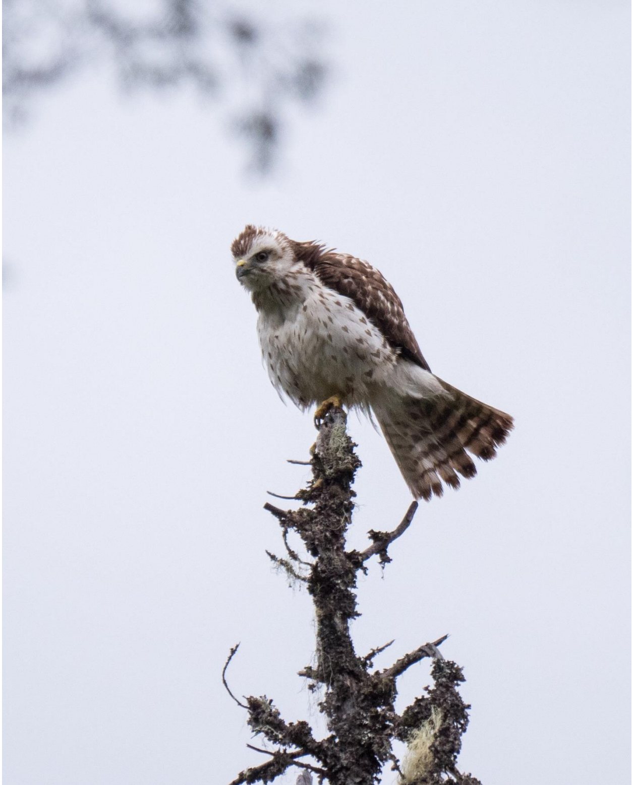
Broad-winged Hawk immature along the main road in the Skagit Valley outside Hope on May 15, 2020.