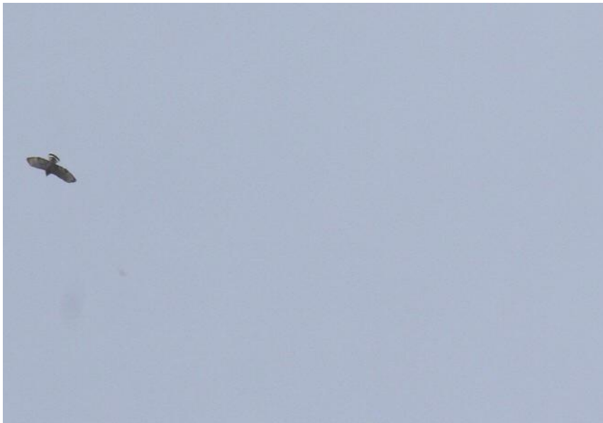
Broad-winged Hawk adult found flying over Vedder Mt. on September 23, 2018.