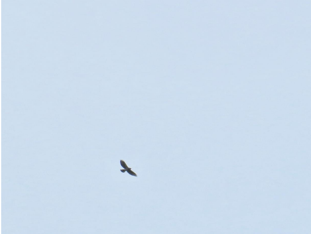
Broad-winged Hawk adult found flying over Port Moody, on May 4, 2019. This is the first photographed record for Vancouver.