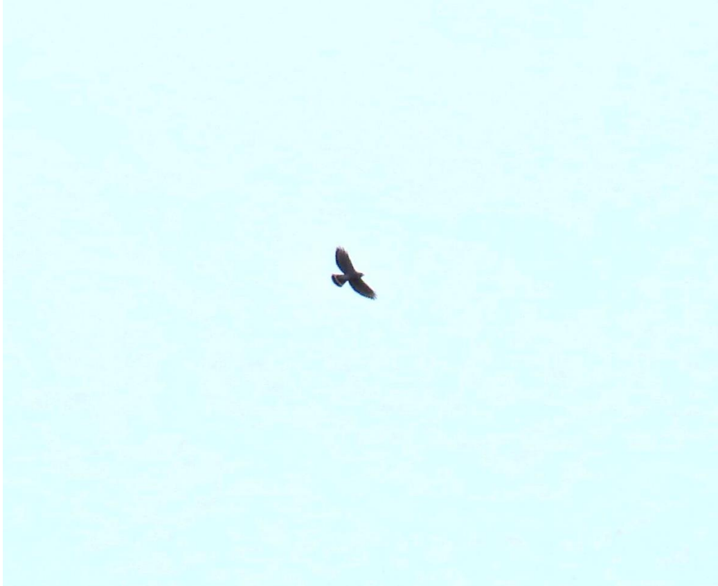
Broad-winged Hawk adult found flying over Port Moody, on May 4, 2019. This is the first photographed record for Vancouver.