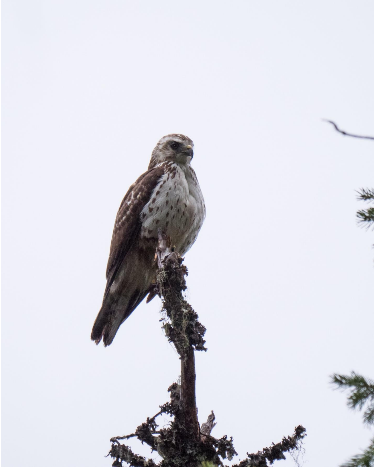
Broad-winged Hawk immature along the main road in the Skagit Valley outside Hope on May 15, 2020.