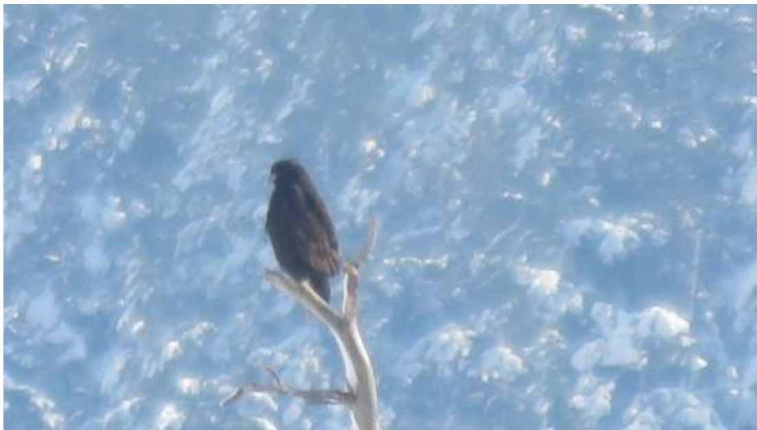
Broad-winged Hawk (adult dark morph) found outside Chase on the extremely late date of November 5, 2017.