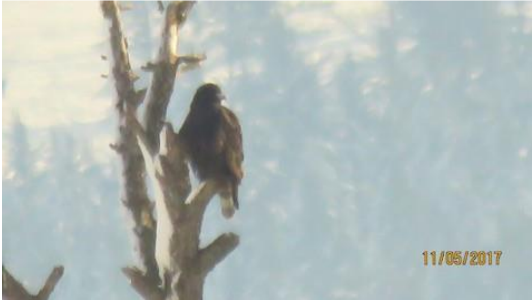
Broad-winged Hawk (adult dark morph) found outside Chase on the extremely late date of November 5, 2017.