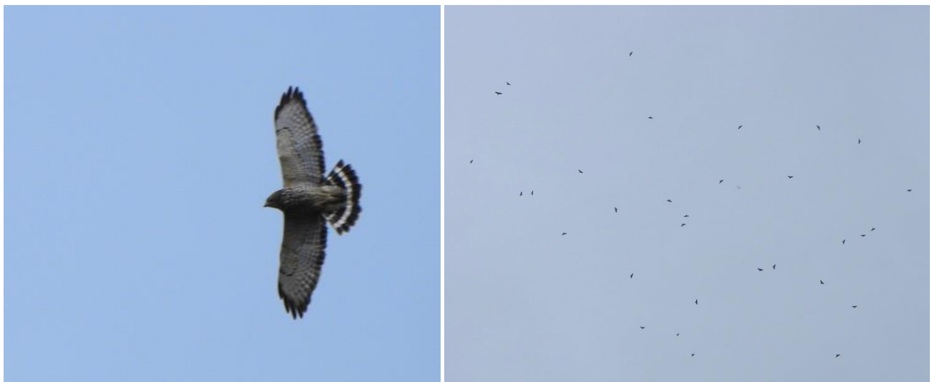
Broad-winged Hawk adult (left) 1 of about 100! (right) found over the McCulloch Cross Country Ski Area, east of Kelowna, in the central Okanagan district, on September 15, 2018.