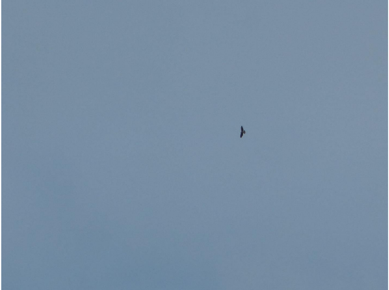
Broad-winged Hawk immature found during a hawk-watch on Sumas Mt. on September 16, 2015.