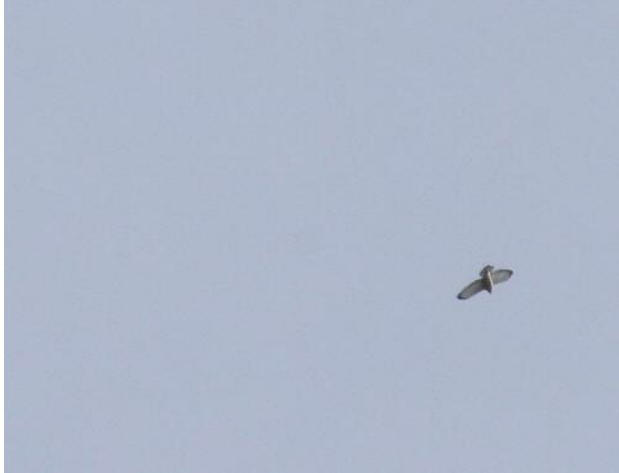
Broad-winged Hawk immature found flying over Vedder Mt. on September 23, 2018.