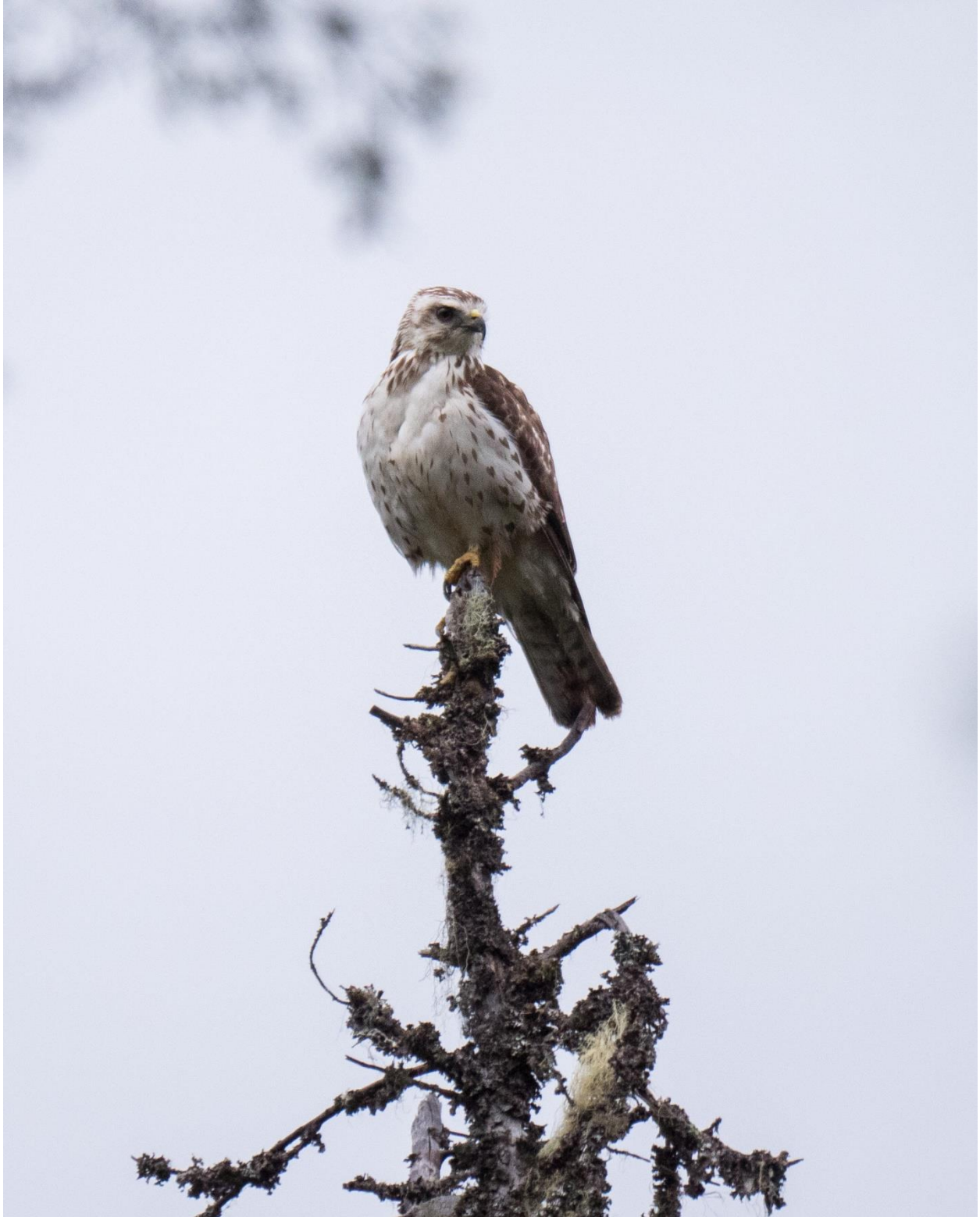
Broad-winged Hawk immature along the main road in the Skagit Valley outside Hope on May 15, 2020.