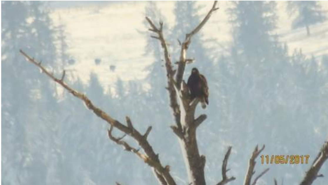
Broad-winged Hawk (adult dark morph) found outside Chase on the extremely late date of November 5, 2017.