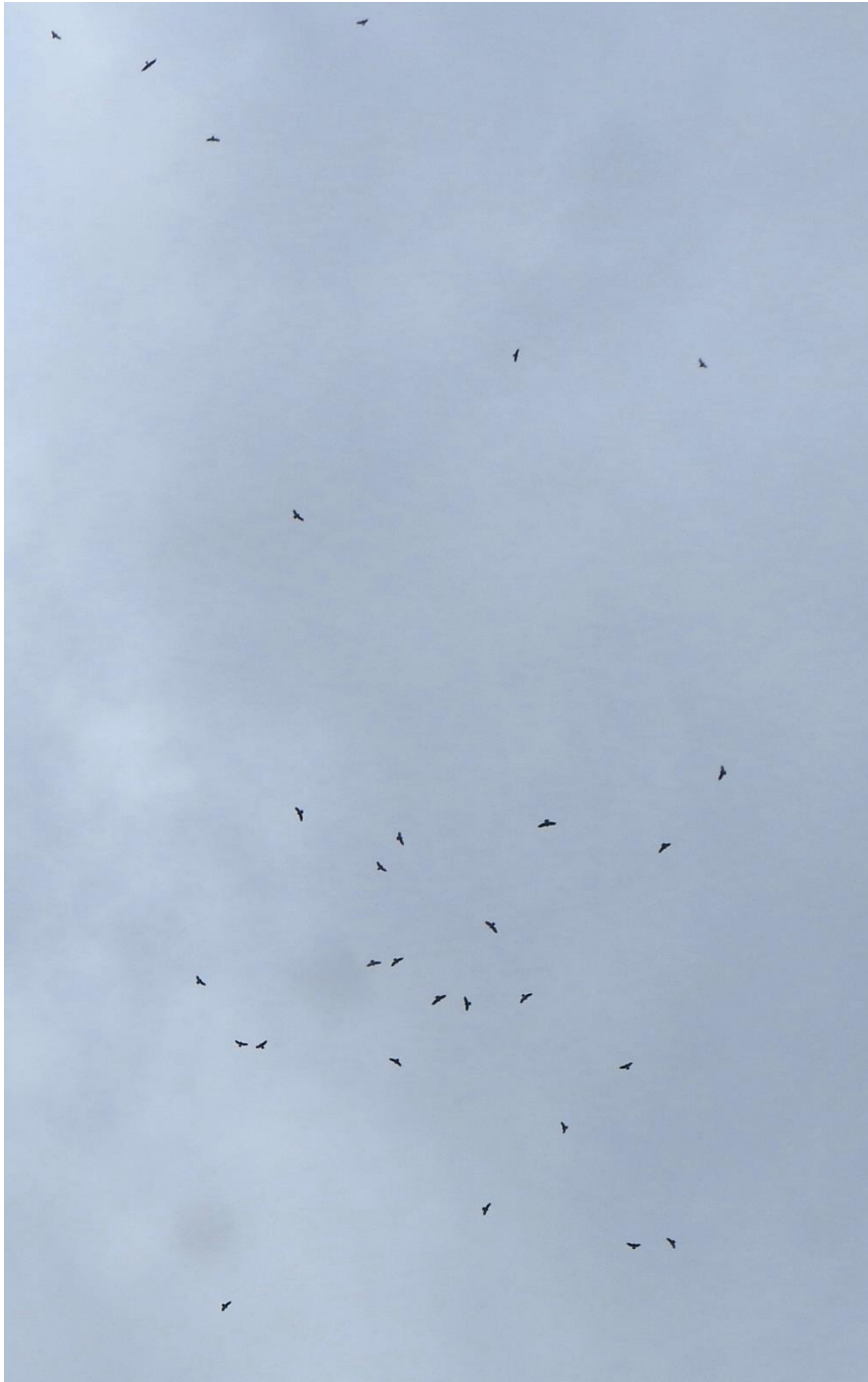
Broad-winged Hawk kettle of about 100 birds found over the McCulloch Cross Country Ski Area, east of Kelowna, in the central Okanagan district, on September 15, 2018. Currently the Highest single recorded total of birds found together at one time in the province Photograph © Kalin Ocaña.