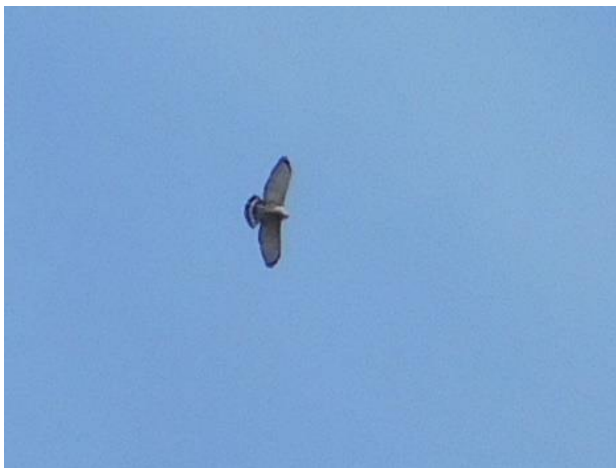
Broad-winged Hawk adult found flying over Quail Ridge Linear Park, outside Kelowna on April 23, 2017. Though not a species that appears in the spring until May, April records have increased in the past 5 years.