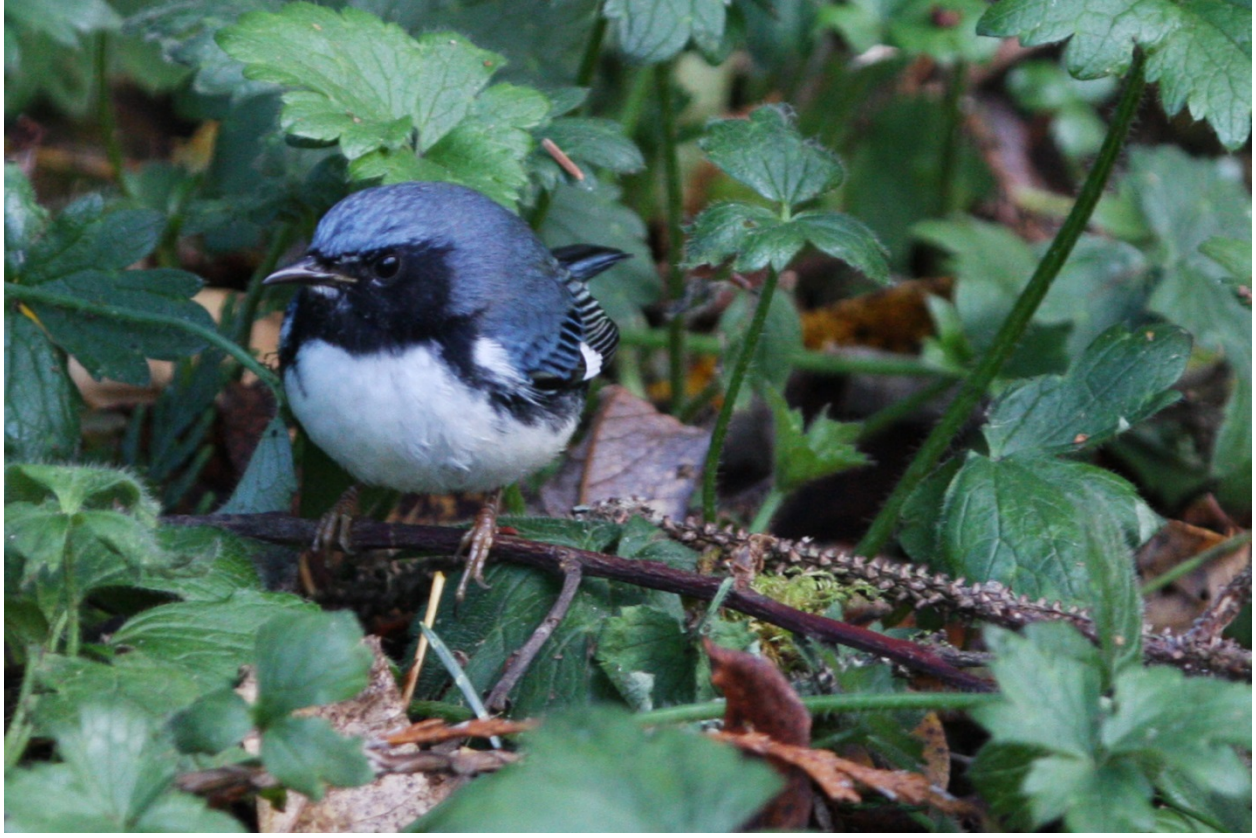
Figure 1: Black-throated Blue Warbler male at Sandspit, QCI on November 19, 2010.

Given the ever increasing frequency that Black-throated Blue Warblers are encountered in British Columbia, it is likely more records will come in the future with the majority of them occurring in the fall.