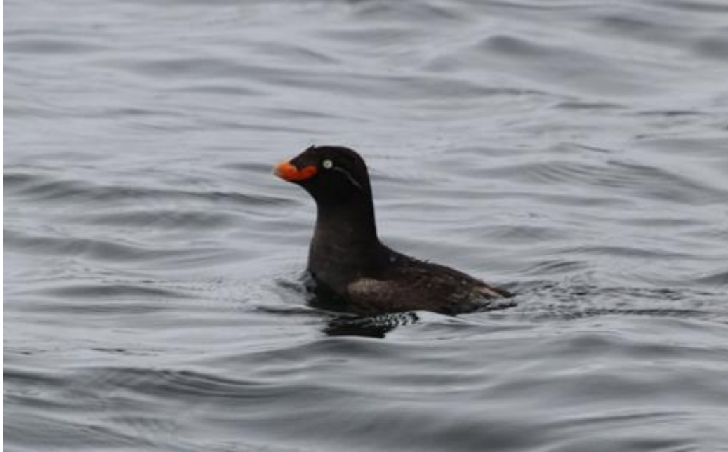
Figure 3: Record #5: Crested Auklet near Cleland Island off Tofino on July 30, 2003.