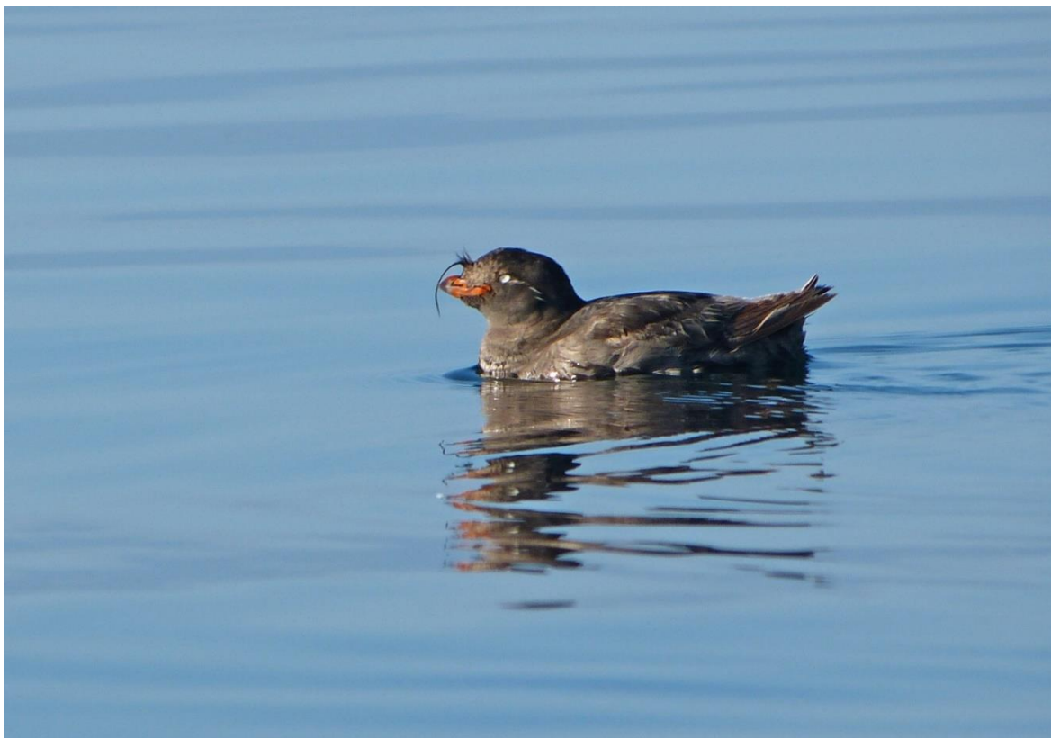
Figure 4: Record #6: Crested Auklet 100m south of Discovery Island off Victoria on September 8, 2013.