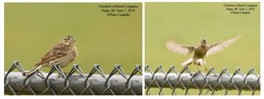
Figures 3 & 4: Chestnut-collared Longspur at Hope Airport on June 7, 2010.