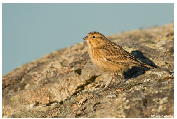
Figures 5 & 6: Chestnut-collared Longspur at Cattle Point in Victoria on October 24, 2013.