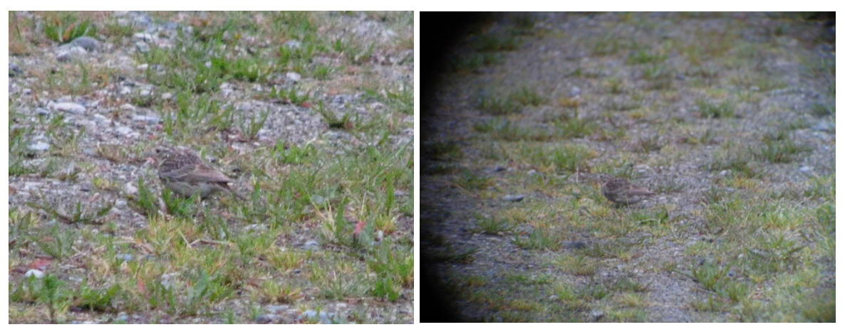
Figure 1 & 2: Chestnut-collared Longspur at Hope Airport on June 6, 2010.

like the Sprague's Pipit (Anthus spragueii), could be found breeding somewhere in the interior of the Province in the future. In the future, summer reports of longspurs should be scrutinized extra carefully for this species. There are the odd summer records in southern British Columbia for Lapland Longspur, but any first summer or female plumaged birds should be photo documented as it is just as likely that the bird in question could be a Chestnut-collared Longspur. Fall records are extremely rare for the Province, but this could change as observers are more careful in checking longspurs encountered during the months of September through November. With the frequency the Chestnut-collared Longspur occurs in both California and Oregon it very likely that British Columbia will see more reports of this beautiful grassland gem in the future. As observer understanding of identification and migration timing increases so will the number of records. This is a species to be watched for in British Columbia again in the future.