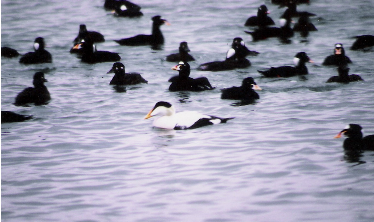
Figure 5: Record #5: Common Eider adult male in English Bay, Vancouver on December 29, 1997. [Same bird as above images only now a full adult male].