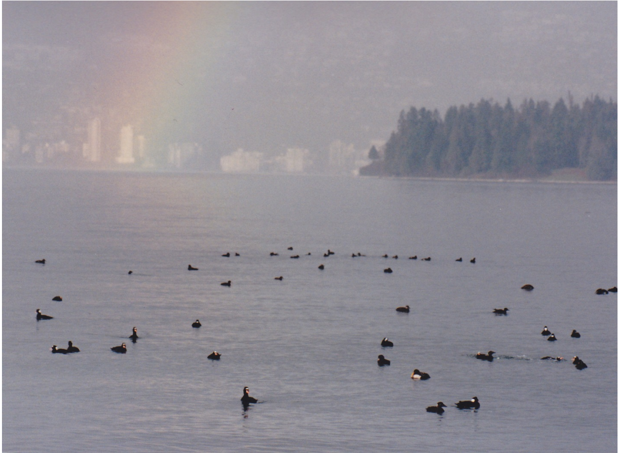
Figure 4: Record #5: Common Eider immature male off Kitsilano Beach, Vancouver on January 12, 1997. Note the white chest, large orange bill and large overall body size.