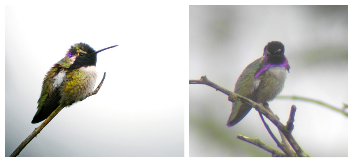
Figure 1 & 2: Costa's Hummingbird adult male at Jordan River on April 7, 2007.

Anna's Hummingbirds have been found in the fall and winter in the Okanagan and even in the Prince George region (Campbell et al. 1990, D. Cecile Pers. Comm.). It seems likely that more late fall or winter Costa's Hummingbird are possible as there is a photo-documented record of a first year male from Wynndel in the Kootenays from November 17- December 1, 2008 (Campbell et al. 1990, Toochin et al. 2014a, Please see Table 1). It is very likely that there will be many more Costa's Hummingbird records for British Columbia in the future as the watching of hummingbirds in back yard feeders is very popular, and most people would notice a male quite easily. As with all rare and interesting species, it is encouraged that observers get photographs of any future Costa's Hummingbird records.