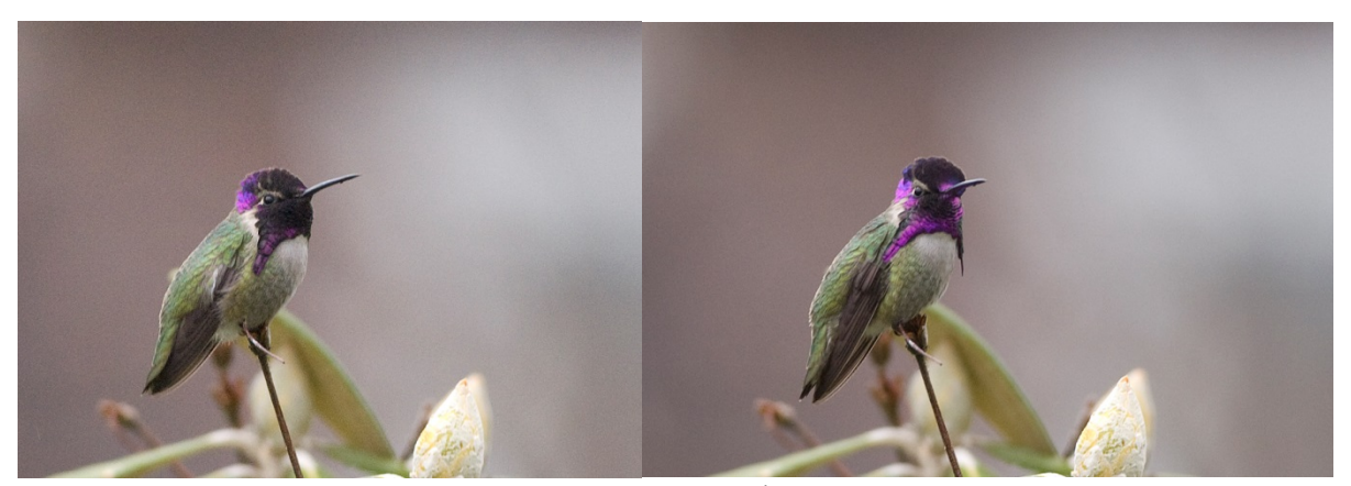
Figure 3 & 4: Costa's Hummingbird adult male at 35<sup>th</sup> and Camosun Street, Point Grey, Vancouver on January 22, 2011.