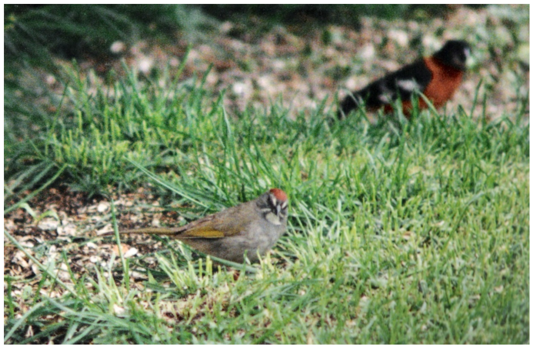
Figure 1: Record #5: Green-tailed Towhee at Glenn Valley in Langley on June 7, 1997.