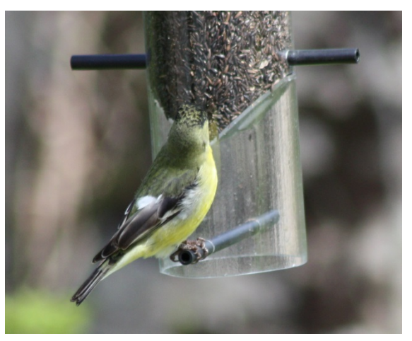
Figure 3 & 4: Record #8: Lesser Goldfinch adult male at Shirley on May 1, 2011.