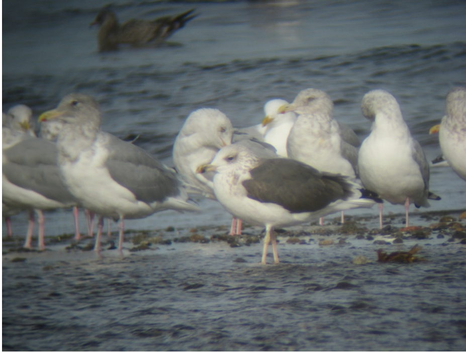
Figure 14: Lesser Black-backed Gull in 3 rd – 4 th cycle outside Sandspit on September 26, 2010.