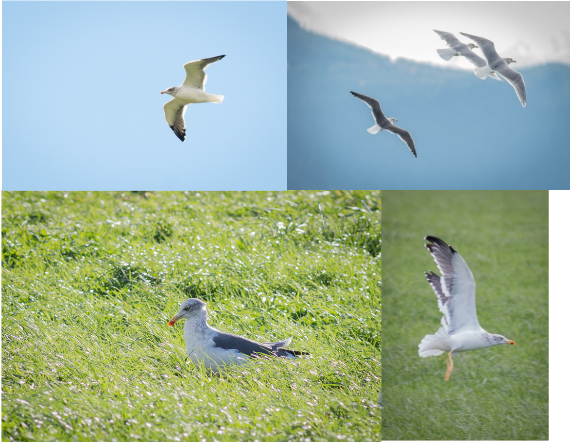
Figure 19, 20, 21 & 22: Lesser Black-backed Gull adult on Whatcom Road, Abbotsford on November 6, 2014.