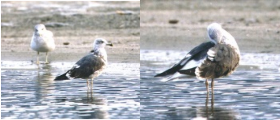
Figure 1 & 2: Lesser Black-backed Gull 2 nd cycle in Vernon on February 18, 2002.

Lesser Black-backed Gull should be considered possible anywhere in British Columbia. If the current trend continues, it is possible that this species will become a regular rarity throughout the Province.