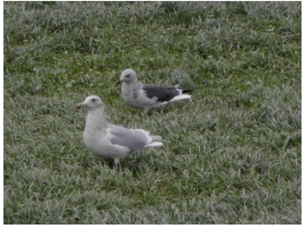
Figure 23 & 24: Lesser Black-backed Gull 4 th cycle along Vye Road and Bowman Road, Abbotsford on December 9, 2015.