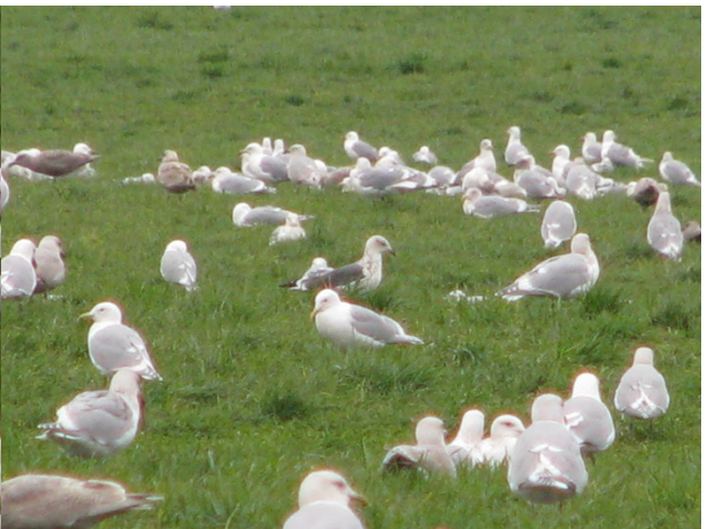
Figure 25 & 26: Lesser Black-backed Gull 4 th cycle along Prest Road, Chilliwack on February 25, 2015. Probably the same bird as Figures 23 & 24.