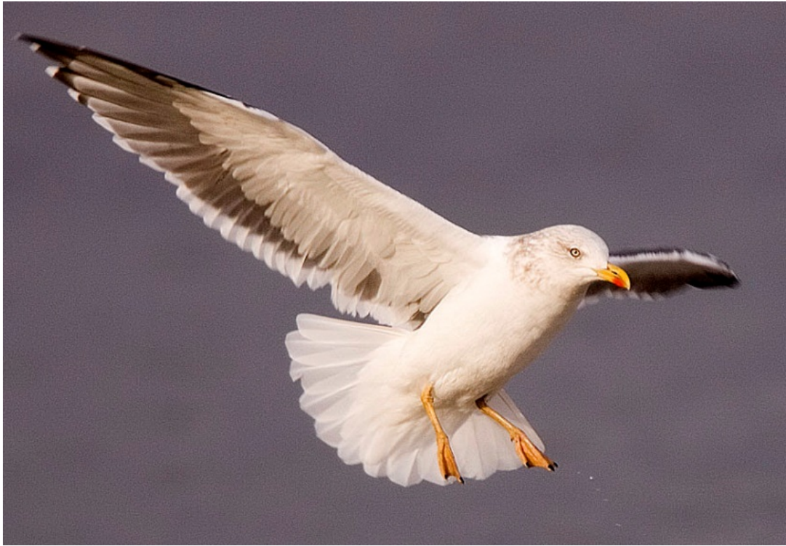
Figure 7: Lesser Black-backed Gull adult in Vernon November 28, 2005.