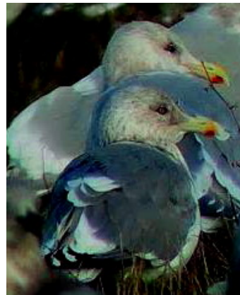
Figure 3 & 4: Lesser Black-backed Gull adult winter plumage in Delta Landfill on December 21, 2003.