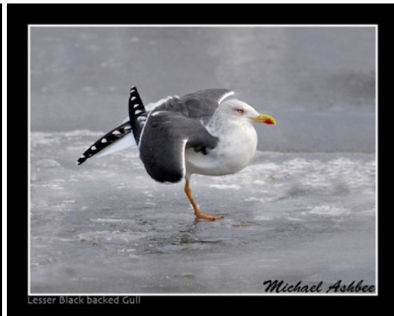
Figure 15 & 16: Lesser Black-backed Gull adult at Maude Roxby Bird Sanctuary, Kelowna on January 24, 2010.