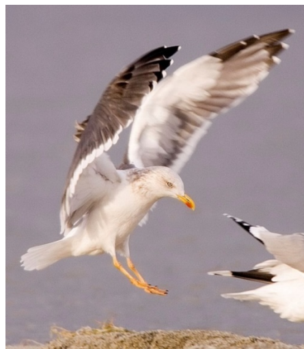
Figure 5 & 6: Lesser Black-backed Gull adult in Vernon November 28, 2005.