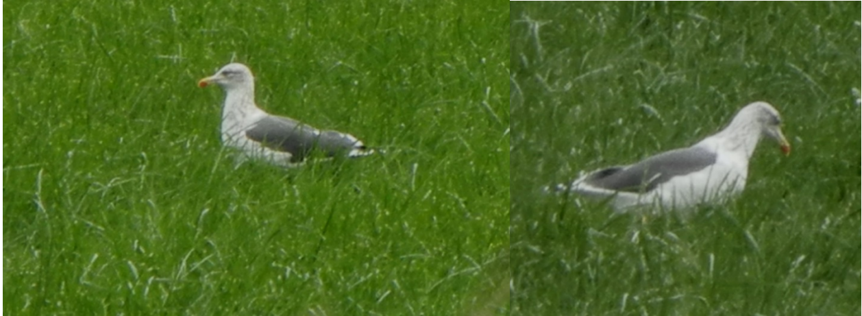
Figure 17 & 18: Lesser Black-backed Gull adult on Whatcom Road, Abbotsford on November 5, 2014.