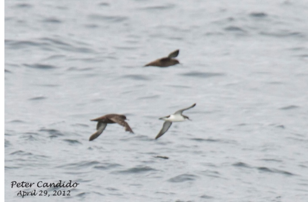
Figures 1 & 2: Record #49: Manx Shearwater (on the lower right in both images) at 9NM off Ucluelet on April 29, 2012.