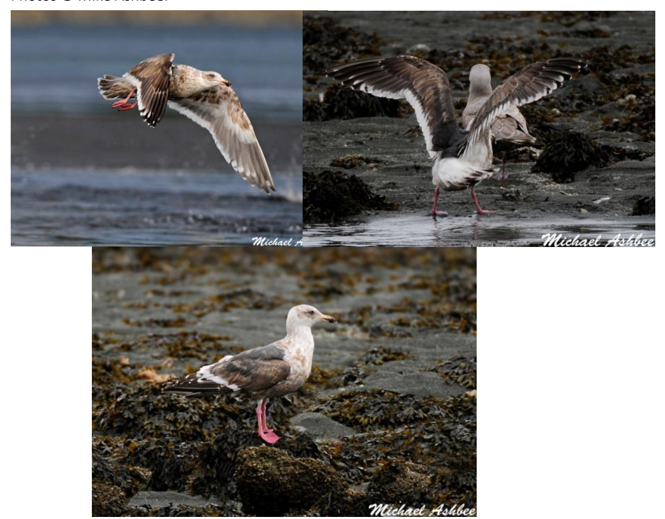
Figure 15, 16 & 17: 2^{nd} - 3^{rd} Cycle Slaty-backed Gull at Deep Bay on March 21, 2010.