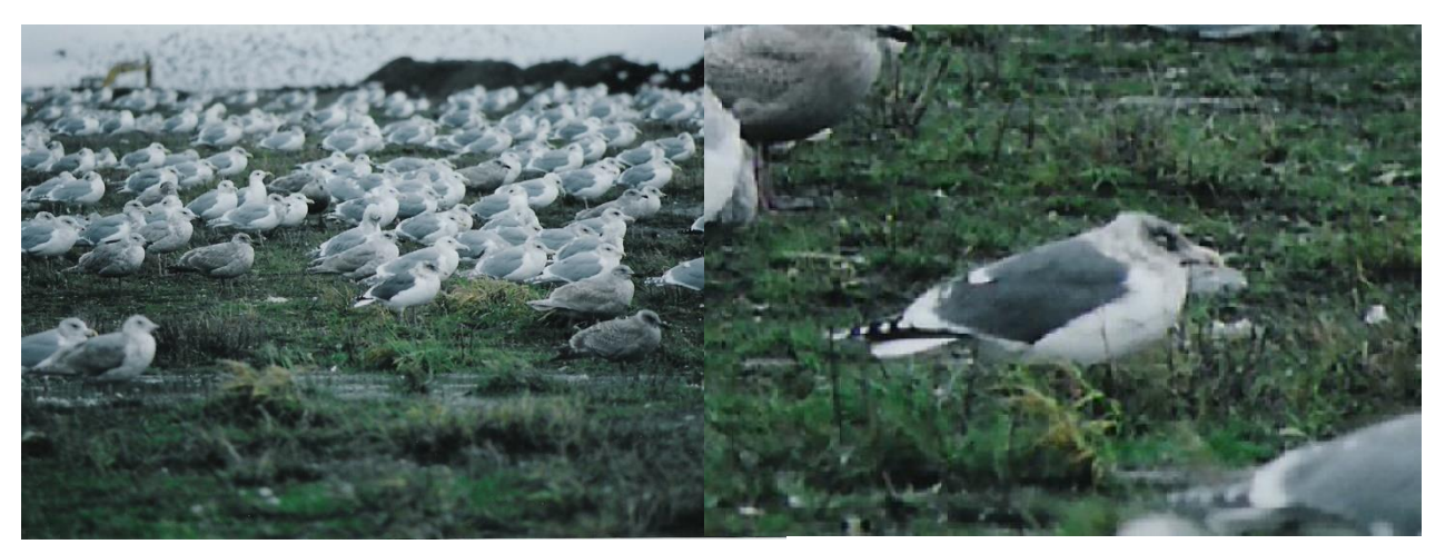
Figure 3 & 4: Adult winter plumaged Slaty-backed Gull in the Delta Landfill on December 14, 2003.