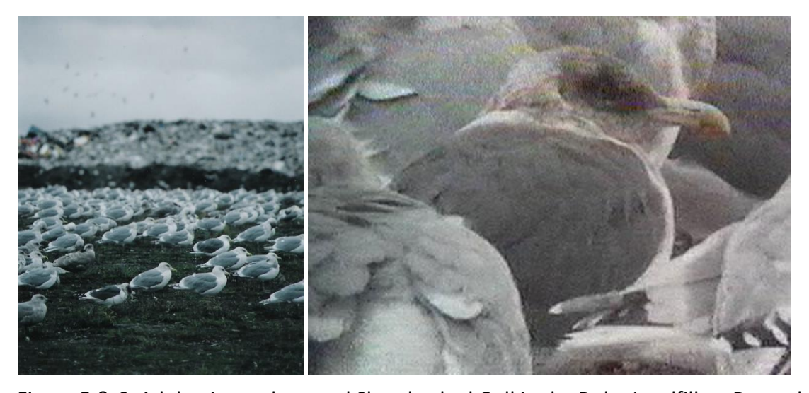
Figure 5 & 6: Adult winter plumaged Slaty-backed Gull in the Delta Landfill on December 14, 2003. on December 22, 2003. *Note comparison in upper left photo with adult Western Gull*