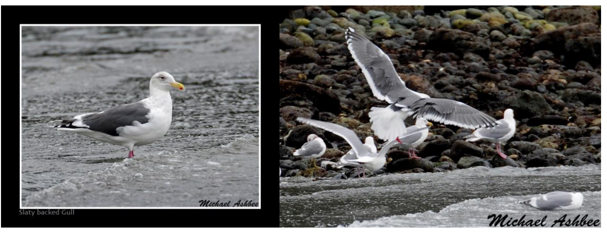
Figure 13 & 14: Adult Slaty-backed Gull at Columbia Beach on March 15, 2010.