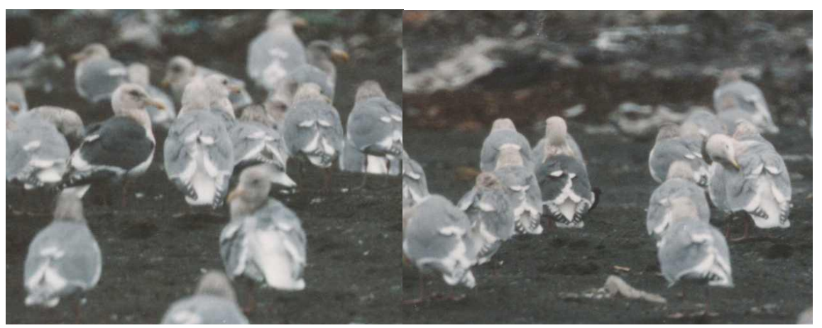
Figure 1 & 2: Adult winter plumaged Slaty-backed Gull in Delta Landfill on January 3, 1994.