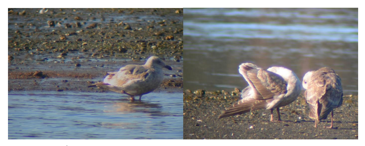
Figure 8 & 9: 2^{nd} Cycle Slaty-backed Gull along Sooke River on February 17, 2008.