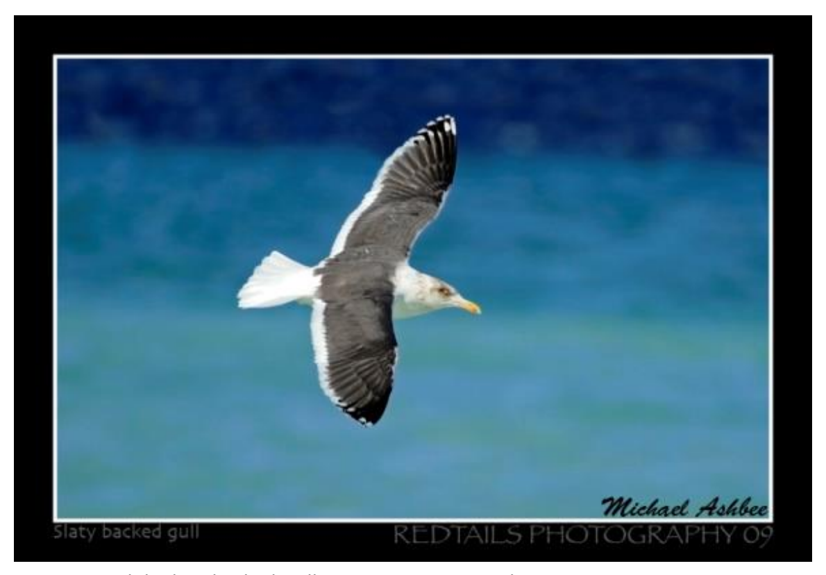
Figure 12: Adult Slaty-backed Gull in Deep Bay on March 8, 2009.