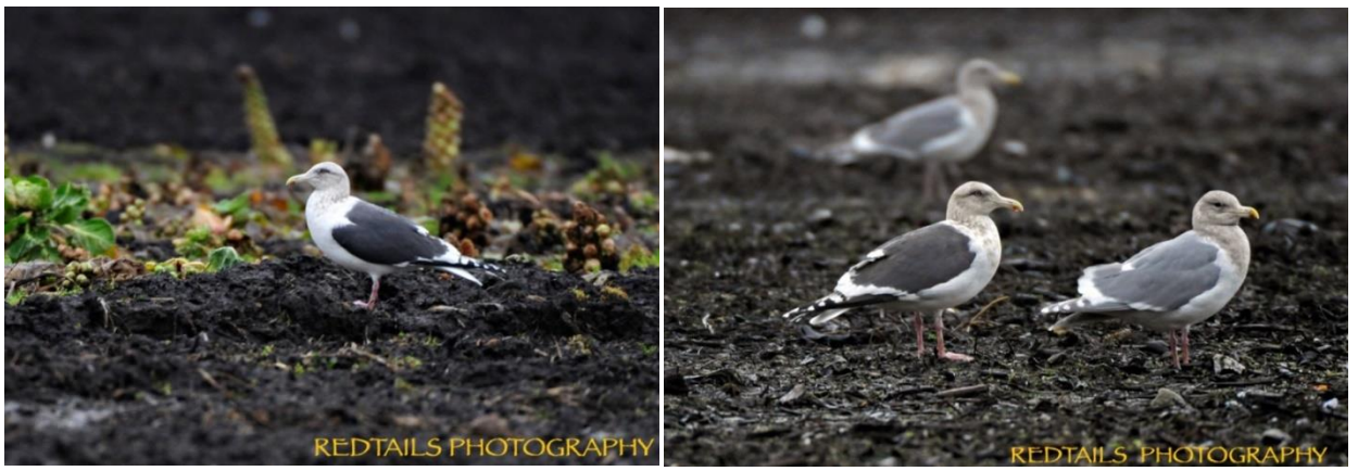
Figure 10 & 11: Adult winter plumage Slaty-backed Gull in Martindale Flats near Victoria on January 10, 2010.