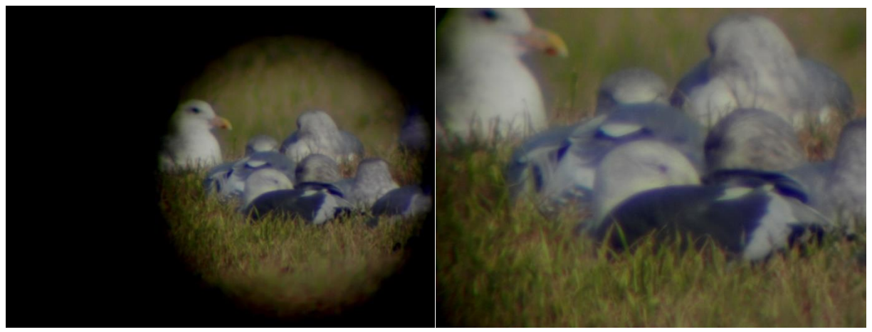
Figure 18 & 19: Adult Slaty-backed Gull in Sumas Prairie, Abbotsford on December 22, 2014.