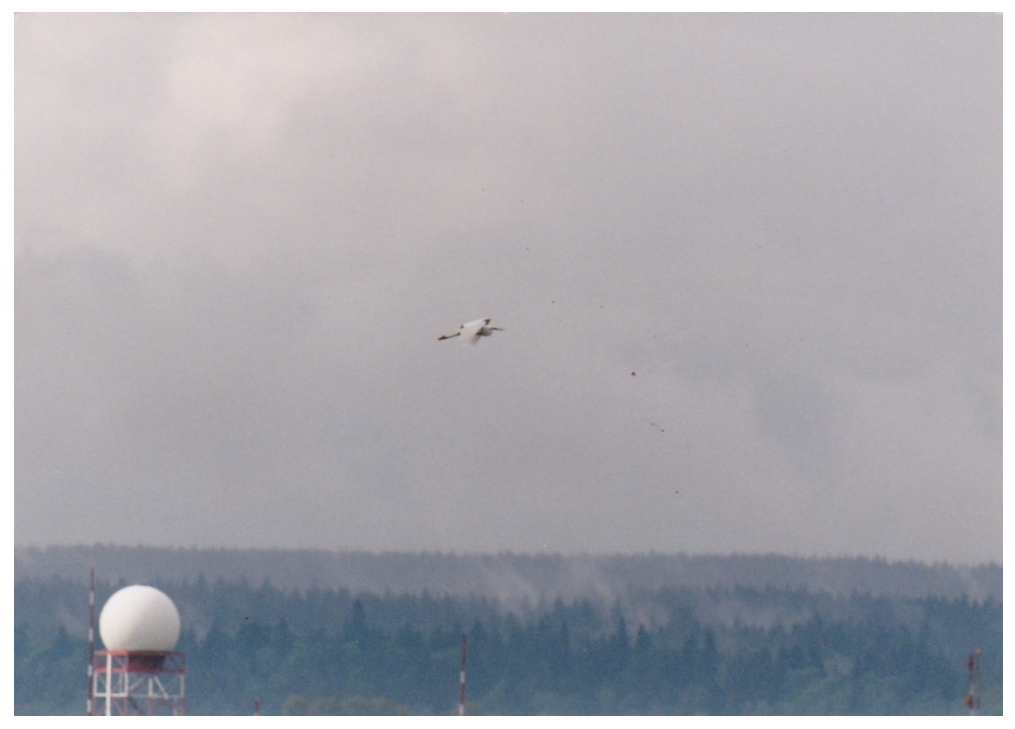
Figure 1: Record # 13: Snowy Egret at Terra Nova in Richmond on May 16, 1999.