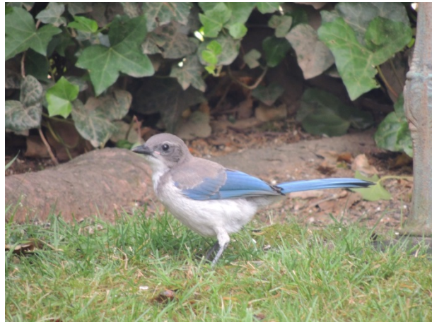
Figure 5 & 6: Record #33: Western Scrub-Jay juveniles at Maple Ridge on July 6, 2014. First nest record for Canada.