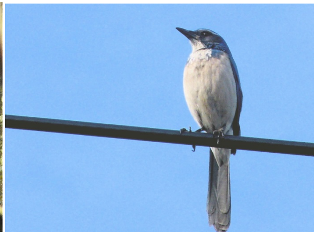
Figure 9 & 10: Record #35: Western Scrub-Jay at the corner of MacDonald Road and Ferguson Road, Sea Island, Richmond on February 21, 2014.