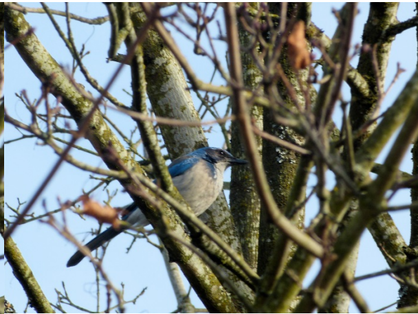
Figures 7 & 8: Record #35: Western Scrub-Jay at the corner of MacDonald Road and Ferguson Road, Sea Island, Richmond on February 21, 2014.