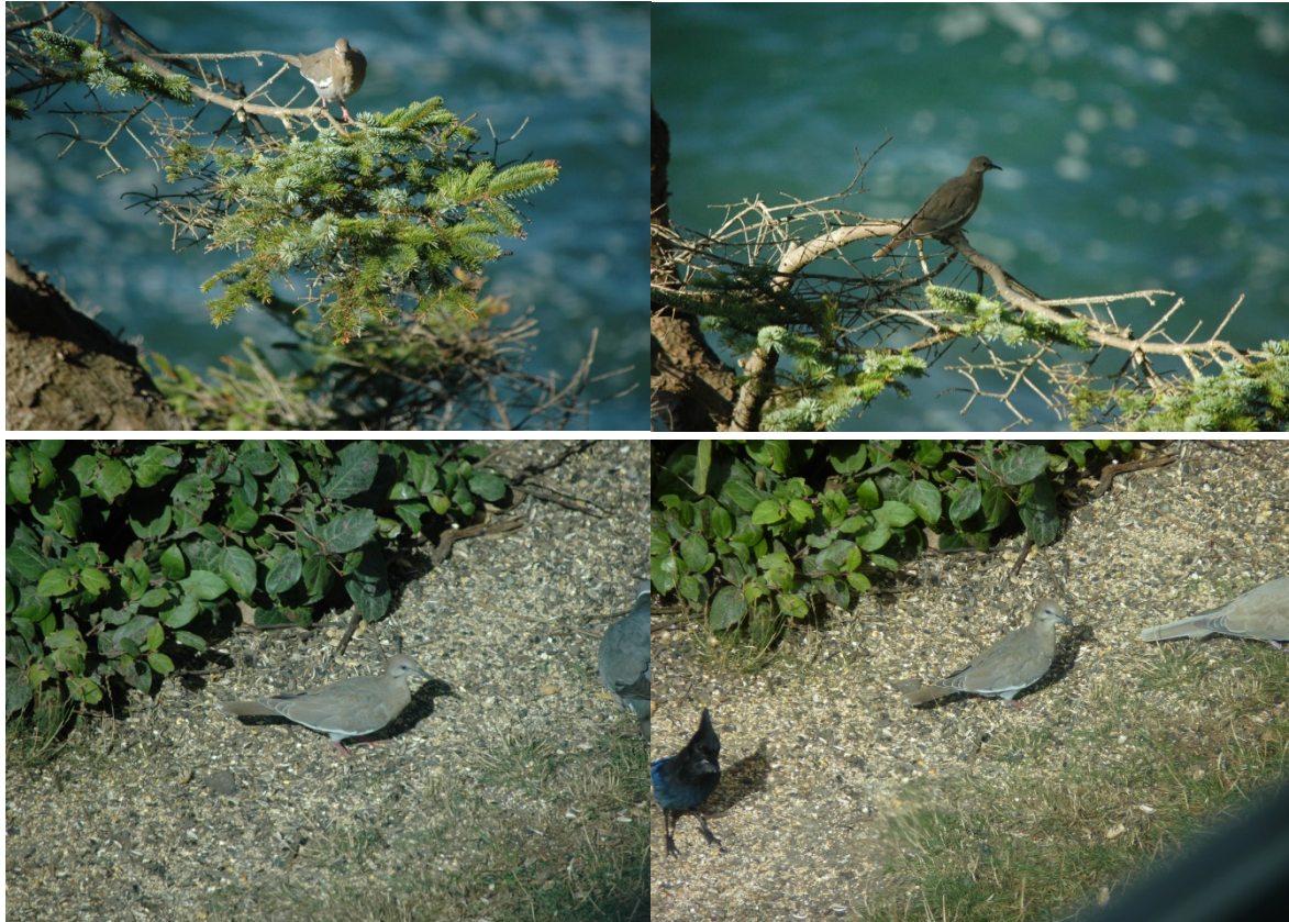
Figures 2, 3, 4 & 5: Record # 16: White-winged Dove in Shirley on September 20, 2014.