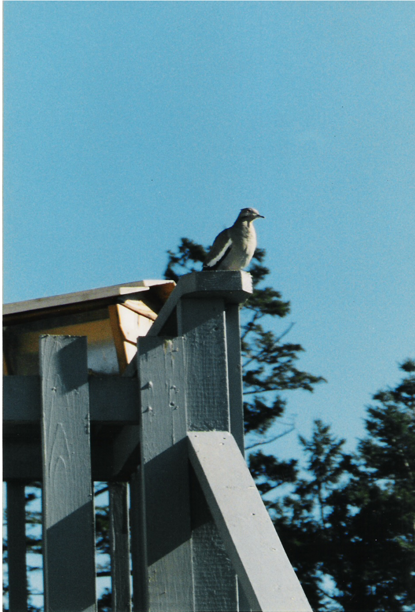
Figure 1: Record #:6: February 9, 2001.