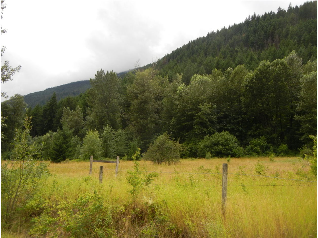
Figure 4: Habitat found in British Columbia that is perfectly suited for Yellow-billed Cuckoo. This photo was taken on July 24, 2014 from an area that had a calling Yellow-billed Cuckoo at North Bend near Boston Bar.