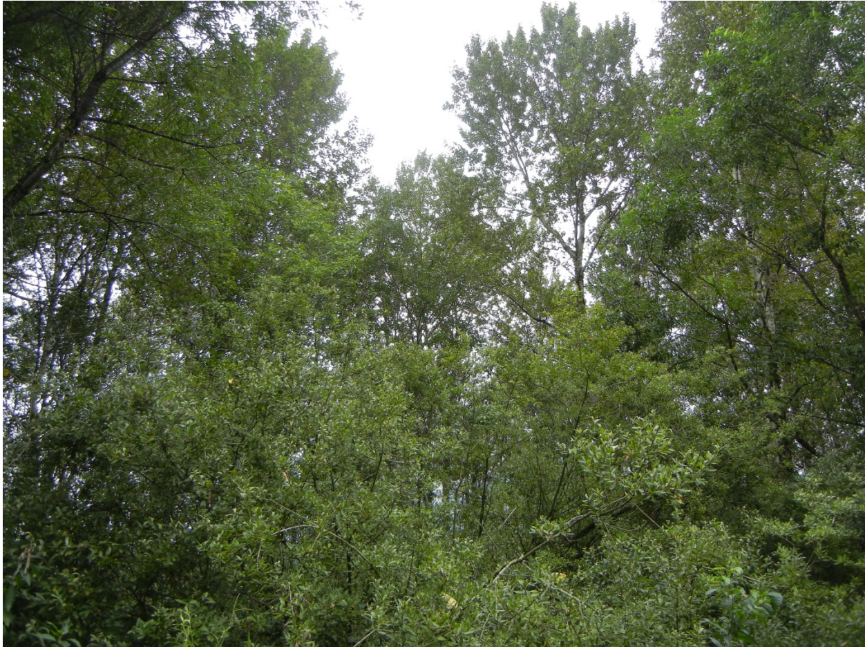
Figure 5: Habitat found in British Columbia that is perfectly suited for Yellow-billed Cuckoo. This photo was taken on August 15, 2014 from an area that had a calling Yellow-billed Cuckoo at Hope Airport.