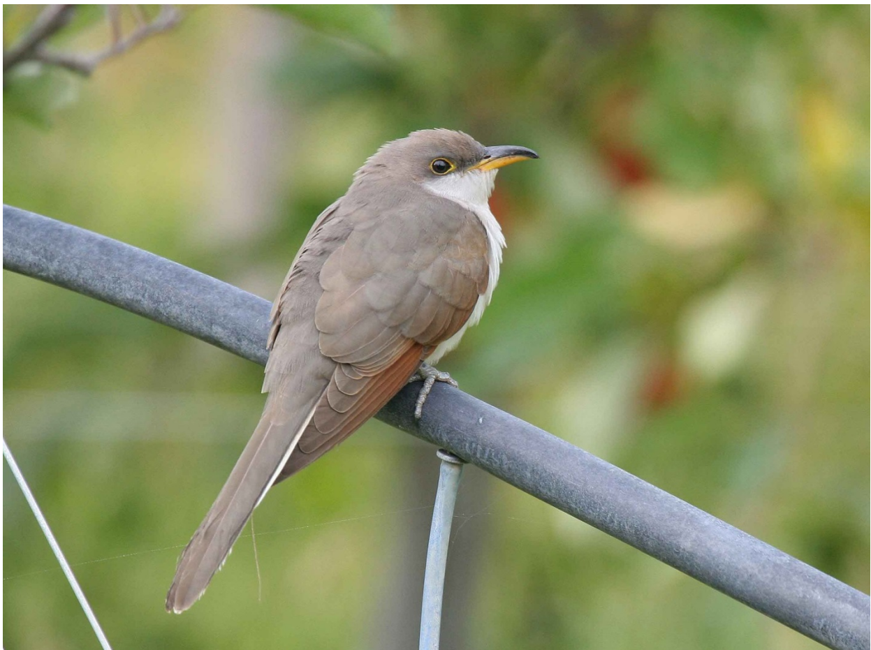
Figure 3: Record #35: Yellow-billed Cuckoo in Cawston on October 20, 2007.