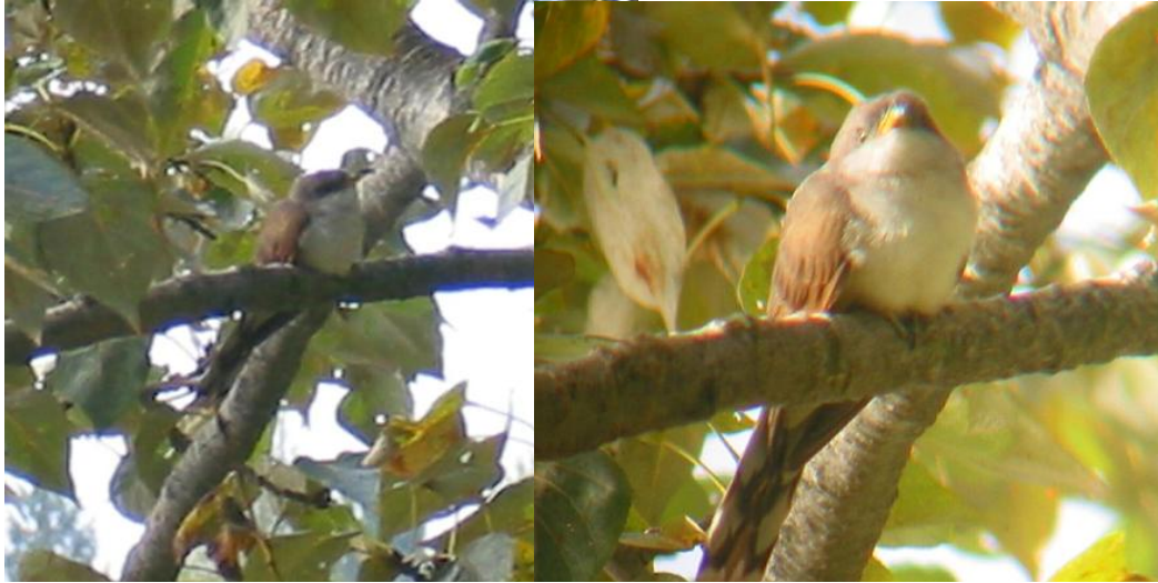
Figures 1 & 2: Record #30: Yellow-billed Cuckoo in Castlegar on October 28, 2002.