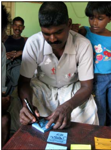
Tamil fisherman participates in a concept mapping activity on ocean changes.

When I arrived in Vancouver to start my MA in August 2008, I was occupied with exploring my new home but also enraptured with a very different place. I dreamed every day of Ghana, of my friends in far-flung rural communities, bowls of spicy groundnut stew, and falling asleep under an African sky strewn with stars. I planned to return there for my fieldwork, where I had done undergraduate research over four field seasons.