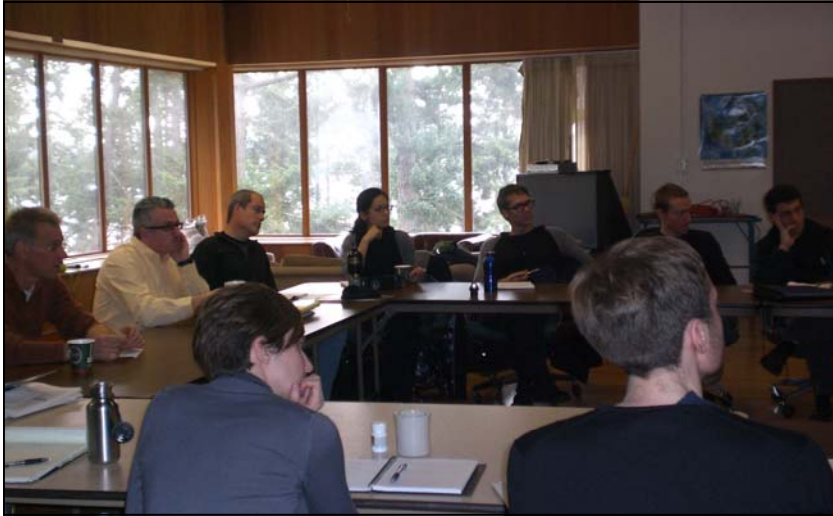
Attentive attendees at the inaugural UBC-UW PhD Proposal Workshop.