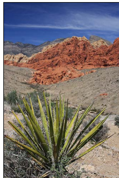
Yucca and rock formations in Sonoran Desert.

I also spent time documenting invasive plant populations in the Okanagan (and elsewhere), work which is tied to our current GEOIDE grant. Through this grant we are looking at predicting invasive plant species spread in the Okanagan, as well as ways to improve public participation in data gathering. The use of volunteered geographic information (VGI) is playing an increasingly important role in biodiversity studies and conservation biology, and we aim to encourage and expand this sort of data gathering. The GEOIDE work ties into the information we provide on E-Flora BC, where updated maps of plant species distributions, and new location reports, are showing range expansion of some species. One concern with invasive species relates to their extended flowering times, and the impacts this could have on native pollinators, which are 'enticed' to remain active much longer than they would be otherwise, and are therefore subject to succumbing to climatic conditions that they normally would not be exposed to (e.g., freezing weather). On E-Flora BC we are developing animated